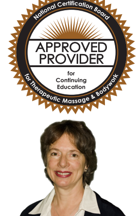
CLT-LANA, NCTMB, NAVALT, CMT, AMTA Dr. Vodder Basic Course Instructor "Live and Learn"